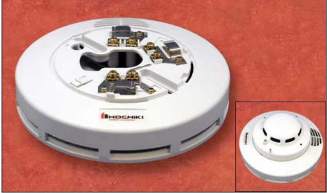
Shown without sensor